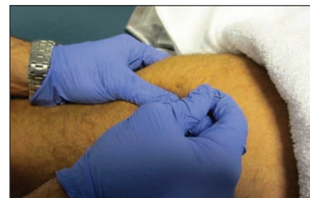
FIGURE 1. Trigger point dry needling of the hamstrings.

Patient 2 was a 69-year-old man with symptoms of left proximal thigh/buttock pain for the previous 5 months, who was referred to physical therapy by his primary care physician with a diagnosis of left hip pain. His pain, as reported on a numeric pain rating scale, was 4/10 at best, 6/10 at the time of evaluation, and 10/10 at worst, and was described as a nagging ache. The patient reported no neural symptoms, no pain along the midportion or distal aspect of the posterior thigh, and no traumatic injury. Exacerbating activities included running and sitting at work for extended periods. Symptoms were gradually getting worse and prevented him from running more than 8 km without pain. At the time of evaluation, the patient was training for a triathlon and continued to run despite pain. His past medical history was unremarkable. The patient's primary goal was to be able to