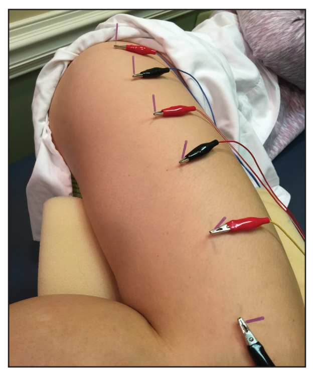
Figure 1. Example of DN placement for treatment. Most proximal needle is placed over the greater trochanter, while each subsequent needle is placed approximately 4 fingerbreadths distal to the previous needle, in the middle of the ITB.

greater trochanteric region, five subsequent needles were inserted four fingerbreadths distal to each prior needle insertion location. The most distal needle was inserted to a depth of approximately 10-15 mm, depending on the amount of tissue per subject, in order to avoid joint insertion. The needles were rotated clockwise to attain needle grasp and left insitu for 15 minutes.