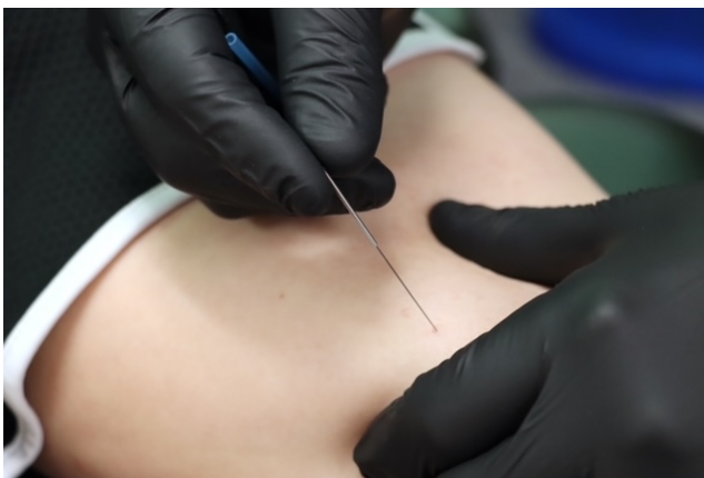
Figure 1. A thin filiform needle to penetrate the skin and stimulate underlying myofascial trigger points, muscular, and connective tissues for the management of neuromusculoskeletal pain and movement impairments.