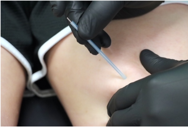
Figure 2. The thin filiform needle in the guide tube at the site in preparation to be tapped into the epidural layer of the skin.

force that set forth a final set of competencies for physical therapists for the safe and effective use of dry needling in clinical practice. 11